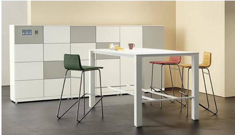
Epoxy Legs and Beams 1800w x 800d x 1050h mm Price: 487£