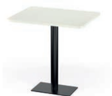
Centrally positioned table