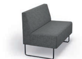
2-person bench seat